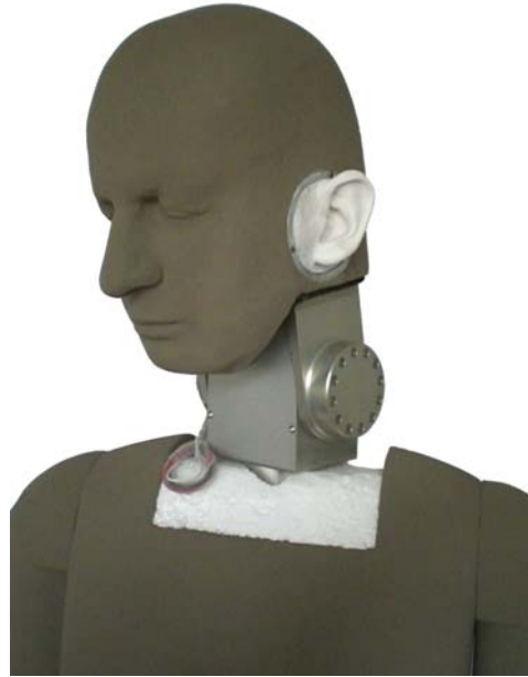
Fig. 2: Close-up view of the FABIAN dummy head with uncovered neck joint

An new unisex corpus has been designed according to anthropometric data representing the 18-65 year old german population's median values [7]. For measuring in sitting or upright position the corpus was designed to be modular to some extent and can be detached from turntable and supporting stands.